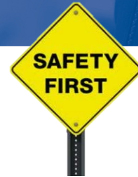
PLAXTOL SPEED WATCH SCHEME – SITE 2

The Street eastern end, on the village green (at Plaxtol Spoute) Speed limit 30 mph. Direction of traffic: east-bound (away from Plaxtol).